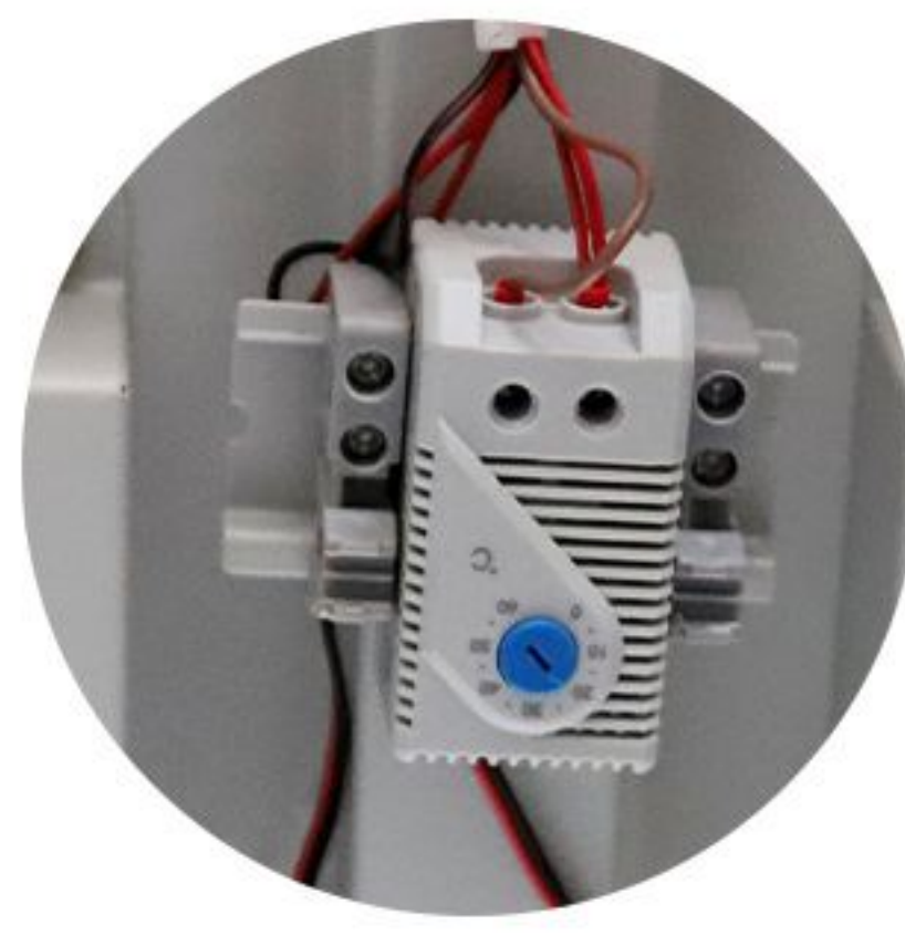
fan module controller