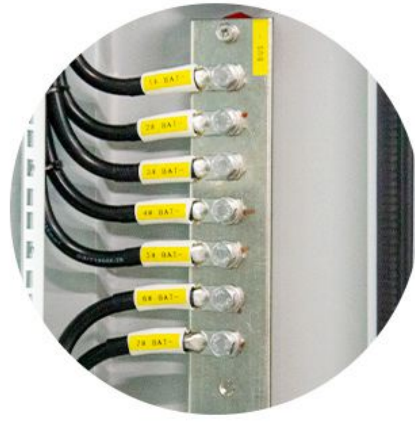
copper BUSBAR -negative