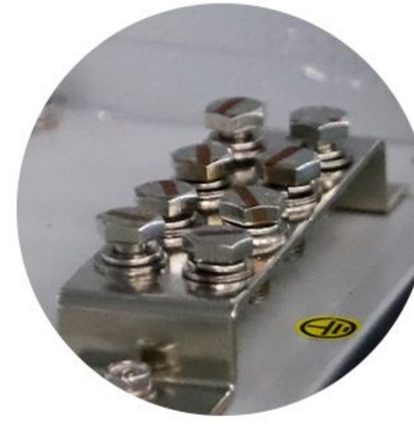
ground copper bar