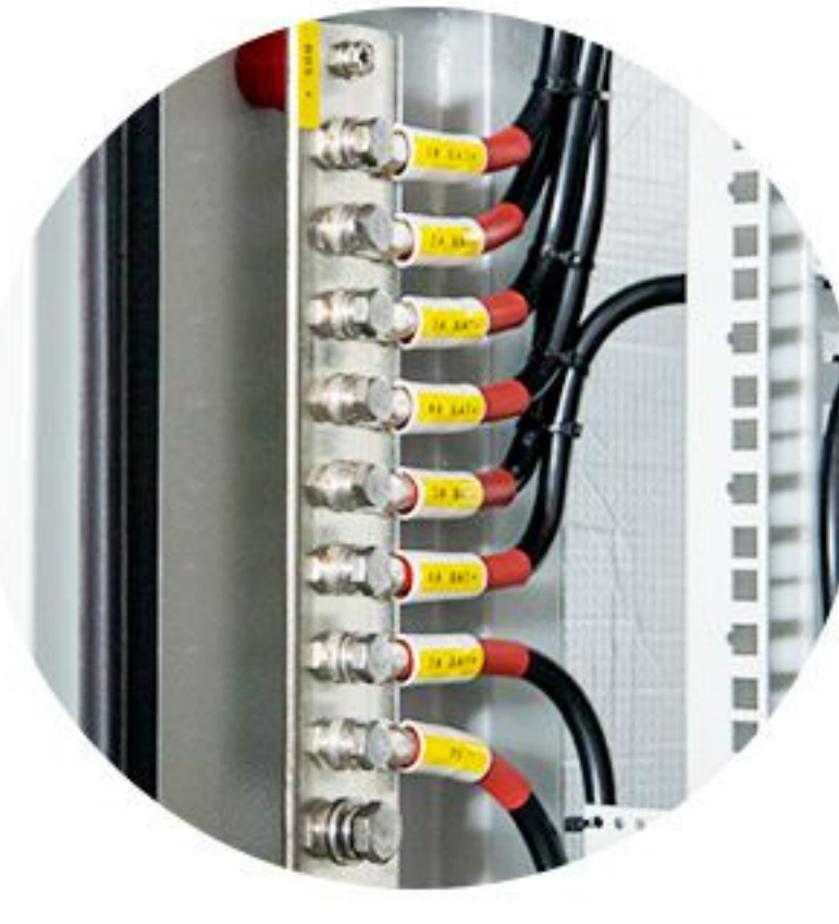
copper BUSBAR -positive